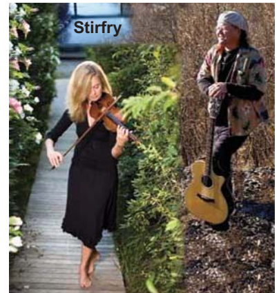
The band Stirfry has an eclectic style which surges from gypsy-jazz to Latin to Celtic. A typical performance might start with a Celtic air and a jig, followed by an eastern European czardas, a jazz cover, some Latin grooves, and some Stirfry originals.

ENTERTAINMENT: Wednesday, July 1st: We have a primo band, Stirfry, booked for an evening SRCA informal reception at the conference hotel. Thursday, July 2nd: Local music jam at the Cove Spring Park campground with local musicians. Bring your instrument! Friday, July 3rd: Gala reception in our hotel ballroom including the SRCA, the PTN and the Timberframers Guild. Saturday, July 4th: Finish slating and watch Frankfort's fireworks extravaganza!