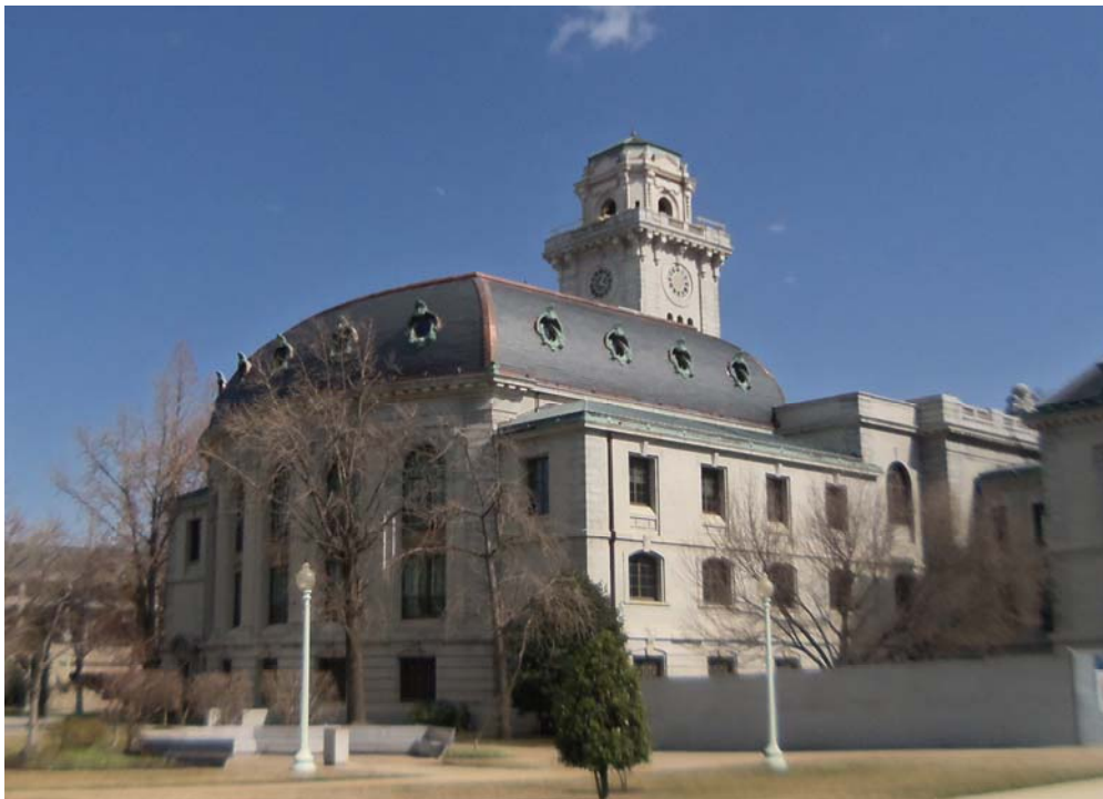
Mahan Hall built 1907 Architect: Ernest Flagg

Feb 8, 2013 (Hyattsville, MD) – Nationally recognized restorer Wagner Roofing was honored today by the National Roofing Contractors Association with two Gold Circle Awards, the industry's highest honor, as well as the Gold Circle Platinum Award for the most superior overall project. The Gold Circle Awards are a national competition to recognize NRCA members for their outstanding contributions to the roofing industry. There were a total of 9 Gold Circle Awards given out this year and Wagner Roofing took 3 of them, more than any roofer in the NRCA history. Wagner Roofing's Gold Circle Awards came in the categories of workmanship and innovative solutions for the company's work on Mahan Hall and its distinctive clock tower at the U.S. Naval Academy in Annapolis, Maryland.